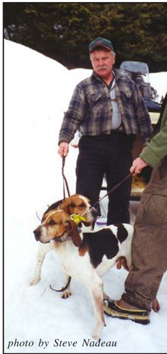
Keeping hounds leashed until a fresh track is found will reduce the length of the chase and decrease the likelihood of dog-wolf encounters.

“attacking (killing, wounding, or biting) or in the act of attacking (actively chasing, molesting, harassing) their livestock (includes livestock herding & guarding animals) or dogs.” However, the taking of a wolf must be reported within 24 hours and the injured or dead livestock or dog and any other evidence must be evident to verify that a wolf attack was imminent. Furthermore, where confirmed wolf depredations of livestock or dogs on private land or grazing allotments have occurred, and are likely to occur again based on the continued presence of wolves, the private landowner or grazing allotment permittee may be issued a “shoot-on-sight” permit. Keep in mind that it is only legal for the land owner, outfitter, or permittee to shoot wolves that harass or attack dogs on private land or grazing allotments— it will remain illegal to shoot a wolf attacking pet dogs or hunting hounds on public land.