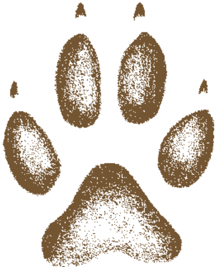
This track shown actual size.